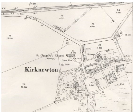
Figure 8: Second edition Ordnance Survey ... 25-inch c.1897