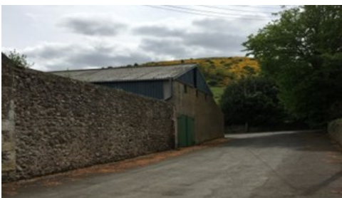
Figure 20: Stone walls