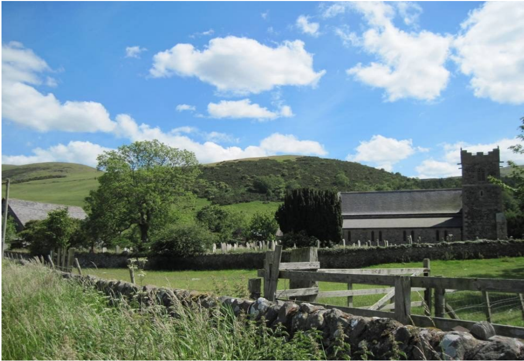
Figure 2: Kirknewton village within the landscape

omission of any particular building, feature or space should not be taken to imply that it is of no interest or does not add value to the character of the area.