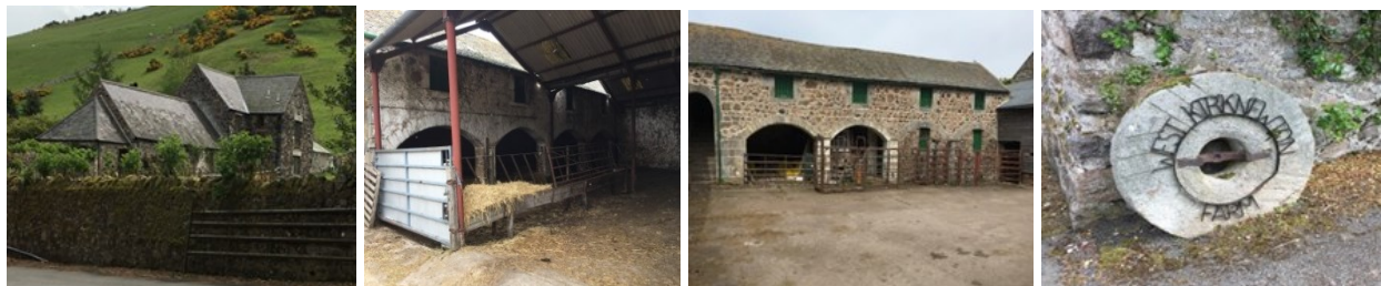
Figure 13: West Kirknewton Farm and farm buildings