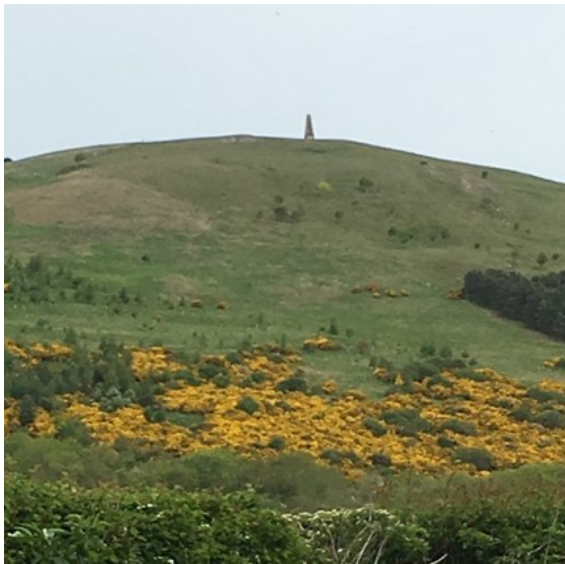
Figure 23: Lanton Memorial

The special character of the village is best viewed in its totality from the surrounding hills, which form an attractive backdrop to the village. Clear views of the village from St Gregory's Hill looking north into the village, or from the Lanton Memorial to the north looking south, are important in understanding the context and layout of the village. Conversely views out of the village towards these hills and to the memorial are also of the utmost importance.