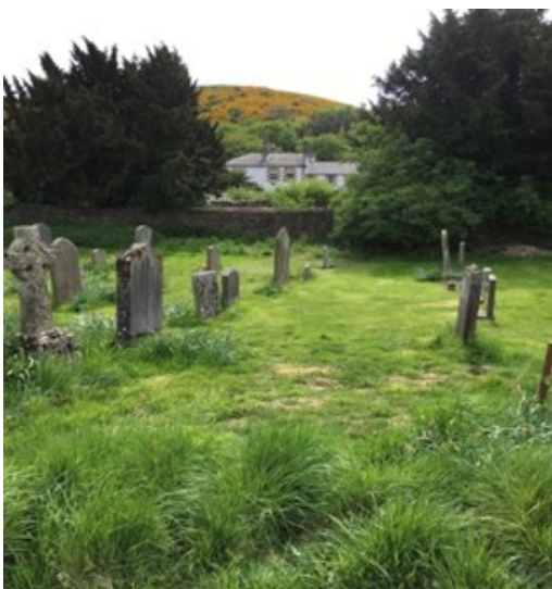
Figure 26: Open spaces