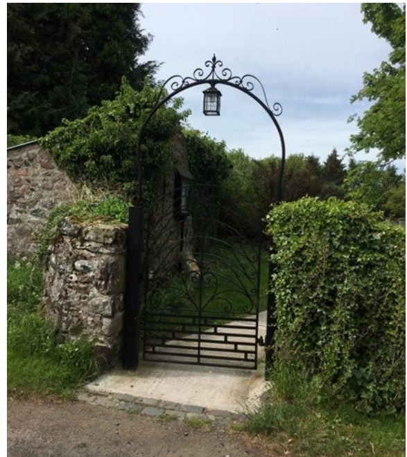
Figure 24: St Gregory's Church and its boundary

Other important focal points include the War Memorial, located to the east of the village and separated from its core by the busy B6351. It serves as a focal point and can clearly be seen from within the village. There is also an intrinsic and important link with the village and the wider valley to the service men and women who came from the area and gave their lives for their country in two World Wars.