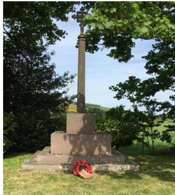
Figure 11b: War memorial

Throughout the century the number of people employed in agriculture continued to decline as a result of mechanisation and the decline in farming incomes. The size of individual farm tenancies correspondingly increased leading to many farm complexes becoming partially redundant. Consequently agriculture no longer employs the bulk of the village's population. Moreover, domestic service, which also provided substantial employment on the estates of north Northumberland at the beginning of the 20th century, had ceased to be a significant factor by the second half of the century. The second half of the 20th century also saw rural services and facilities come under increasing threat. The fate of the railway line through Glendale was an early example of this and, as noted above, the passenger and goods trains were withdrawn from service by the mid-20 th century. The latter half of the 20 th century experienced some change to the built environment with the construction of the new village school in the 1970s.