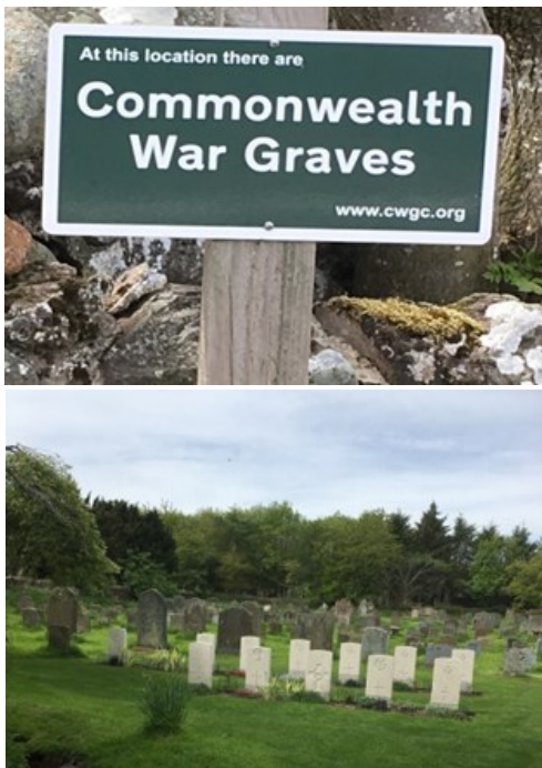
Figure 11a: Commonwealth war graves

The outward form of Kirknewton has altered relatively little in the 20th century, but this masks profound changes in the local economy and population. The First and Second World Wars drew men away from the Glendale estates to fight. The many who never returned are commemorated on the war memorial at Kirknewton. Nearby Milfield Airfield was established as an RAF base to intercept Luftwaffe bombers attacking from Norway and later became one of the main centres for training aircrew in the 'air to ground' attack methods vital for the control of the Normandy beach-heads and the following 'push' through Europe. The airfield was manned by pilots of many nationalities and the tombstones of airmen killed in action (and during training) can still be seen in Kirknewton churchyard; all of the tombstones are distinctive and decorated with the crest of the particular squadron or wing to which the deceased belonged.