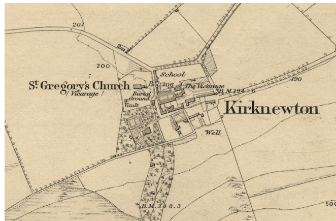
Figure 7: First edition Ordnance Survey 25-inch c.1860