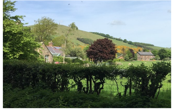
Figure 10: Station cottages and the Old School House

In 1828 the form of the village had a clear resemblance to the village of today, with the church, vicarage and East and West Kirknewton Farms established. By 1860 the village school and Kirknewton House had been constructed and the church substantially rebuilt by the well-known local architect John Dobson who redesigned much of Newcastle upon Tyne. The following decades saw the building of agricultural workers cottages, a school teacher's house and the enlargement of the school. The church tower was added around 1880.