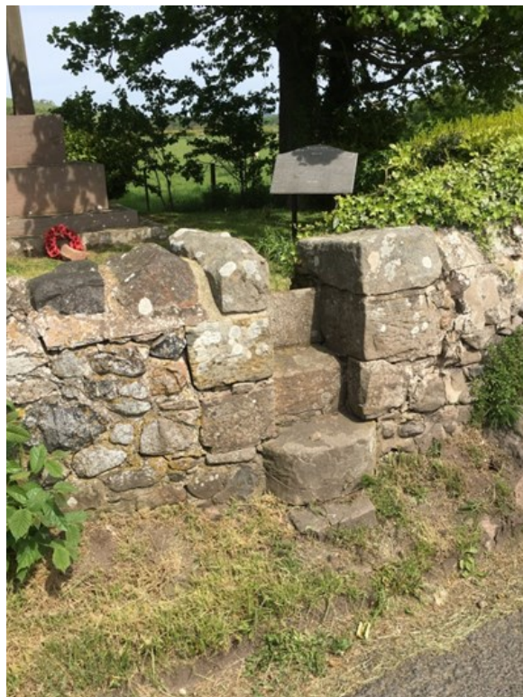
Figure 25: War memorial and stone stile access

The new Village Hall, constructed in 2006, forms a recent community focal point within the village, with many community activities based here. There is also a small notice board and history display setting out the history of the village within the building which provides visitors and newcomers with a basic understanding of the history of the village.