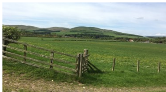
Figure 27: Landscapes