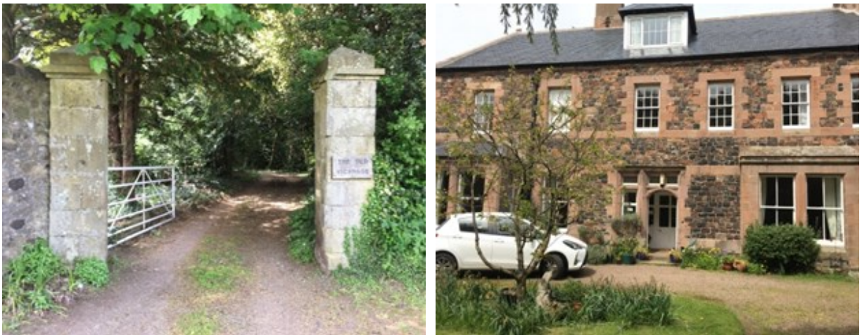
Figure 17: The Old Vicarage

Coronation Wood is located to the west of the settlement and forms a strip of woodland extending from the southern boundary of the Conservation Area, adjacent to the former blacksmith's forge to the northern boundary with the modern agricultural barns. This mature woodland forms an important backdrop to the village and a soft edge to the Conservation Area. The contribution the woodland makes to the setting of the Conservation Area and its character is significant.