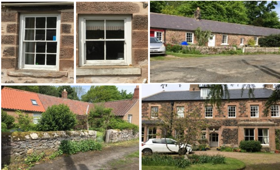
Figure 30: Architectural details – windows, chimneys, roofs, and red sandstone dressings

The smaller and less dominant buildings are no less significant. The farmworkers' cottages are simple in style and modest and appropriate to their status as workers' cottages.