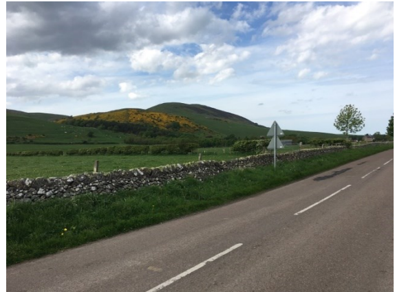
Figure 21: Coronation Woods

Many spaces within the Conservation Area are defined and enclosed by attractive stone walls which act as a network, connecting buildings together, as well as mature hedges. The western edge of the settlement is defined by Coronation Wood and the B6351 on the east side. The village is bounded by St Gregory's and West Hill to the south, while the northern boundary is effectively created by the line of the dismantled railway.