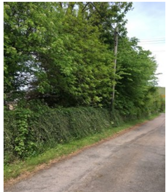
Figure 22: Hedges