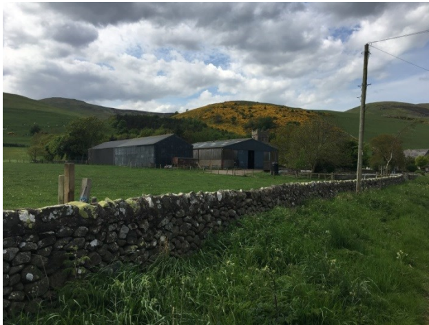
Figure 5: Yeavering Bell

The earliest evidence for human settlement in the area dates to the Iron Age (700 BC to AD 70), with the enclosed settlements on St Gregory's Hill and West Hill attributed to that period. Aerial photographic analysis in the early 2000s identified a sub-circular ditched enclosure in the flood plain to the east of the village of potential Iron Age date. Just over one mile east of Kirknewton is Yeavering Bell, the remains of the largest and most important Iron Age hillfort in Northumberland.