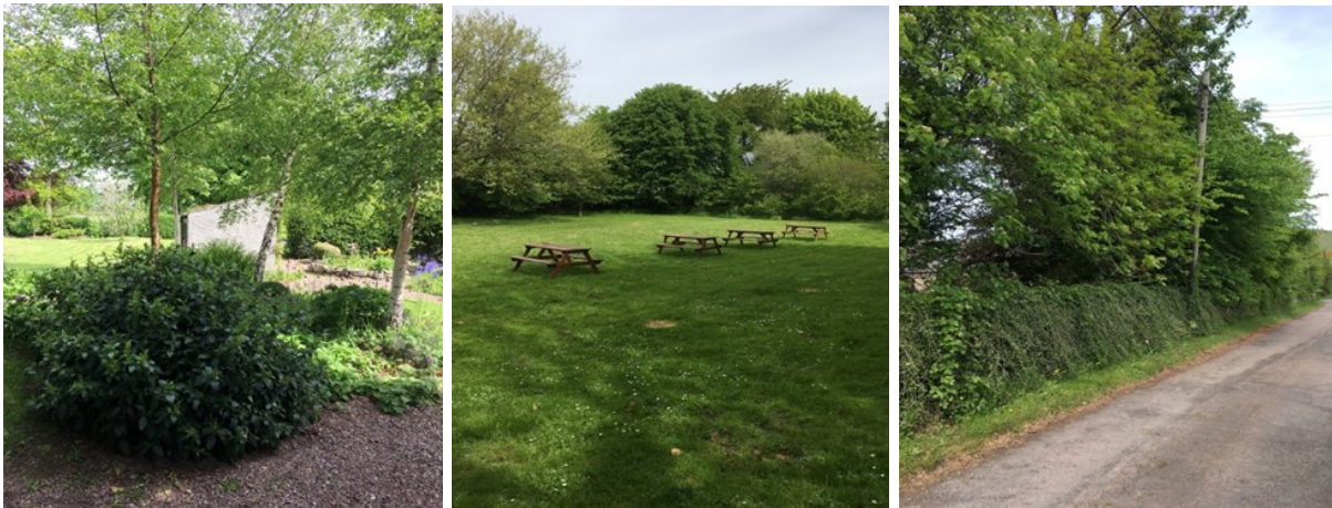
Figure 28: Trees and hedges

Well established hedges bordering the B6351 and the lane leading to the railway cottages are an important landscape feature defining the boundary between public and private space.