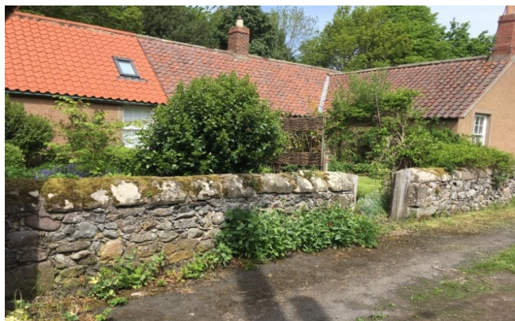
Figure 31: Pantile roofs

Walling materials are typically a mix of random igneous rubble, such as andesites, porphyritic rhyolites, granites and whin from the nearby Cheviot Massif. Being very hard and difficult to dress they were not suitable for window and door surrounds or quoins, which tend to be dressed pink sandstone. After the mid-19 th century little use was made of the igneous stone with coursed dressed sandstone becoming the norm. Boundary walls contain a mixture of sandstone and igneous stones in random form. There are limited instances of stone walled buildings being covered in roughcast, a mix of small pebbles in a lime or cement mix, possibly as a response to penetrating damp. Brick is not at all dominant, although it is evident in small patches when used as a material to repair buildings, mostly farm outbuildings. Later construction materials of the 20 th and 21 st century include vertical boarded timber, as used in the new Village Hall.