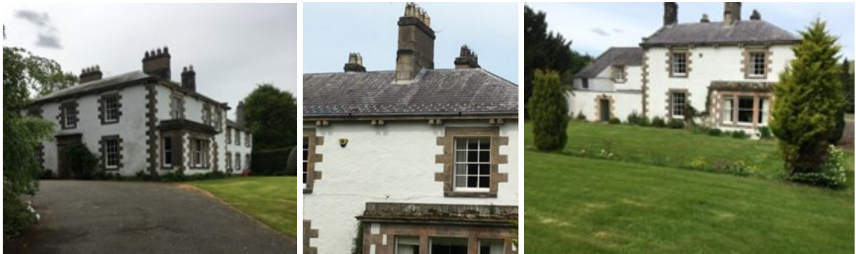
Figure 16: Kirknewton House