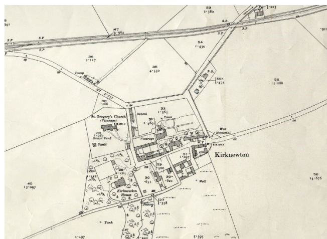
Figure 9: Third edition Ordnance Survey 25-inch c.1920