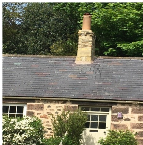
Figure 32: Chimney and slate roof