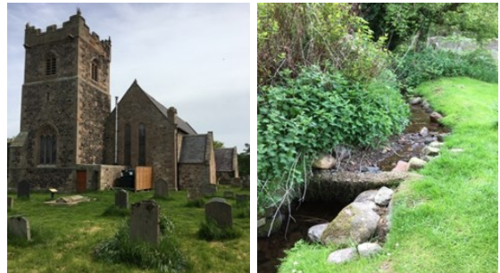
Figure 14: Church, churchyard and stream in the churchyard

The church (dedicated to St Gregory the Great) and churchyard form another dominating element contributing to the character of Kirknewton. The church is the tallest structure within Kirknewton and as such is testament to its status within the village and valley of Glendale. The churchyard surrounding the church is well maintained and as such it makes a positive contribution to the character of the Conservation Area. Many of the headstones within the churchyard are very old and have weathered. A small stream runs through the Graveyard close to the south-eastern entrance is an attractive element adding