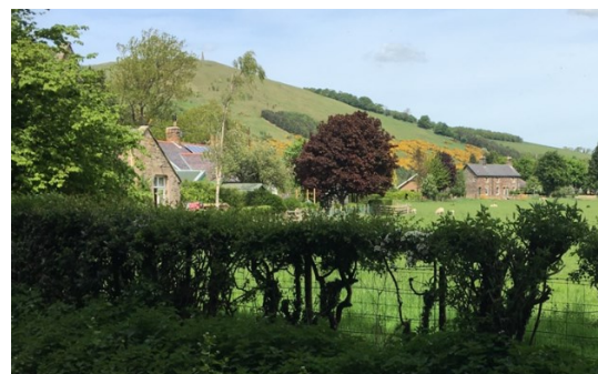
Figure 19: Station cottages and Old School House