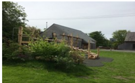
Figure 15: Village Hall and Outdoor Activity Centre