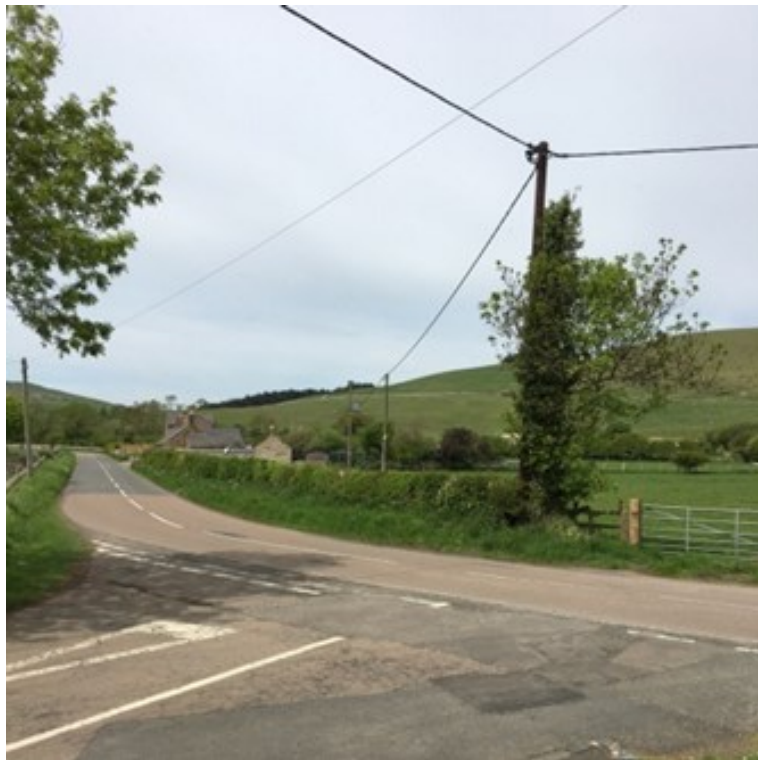
Figure 29: Overhead cables

Overhead cables detract from the rural nature of the village and the undergrounding of these could be included within management proposals for the future improvement of the character and appearance of the Conservation Area. Minor alterations to buildings can have a significant impact on their appearance such as unsuitable window and door alterations and inappropriate use of materials, including the use of cement mortar for pointing repairs rather than the use of lime mortar, which is not only more appropriate from an aesthetic point of view but also helps to preserve the stonework. Overall the buildings within the village are well maintained and cared for and help contribute to maintaining the attractive character of the Conservation Area.