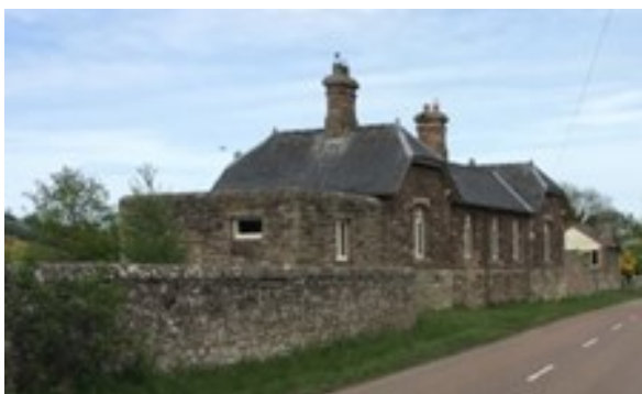
Figure 18: Station buildings