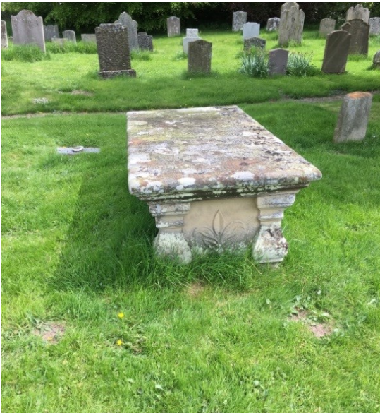
Figure 4: Davison chest tomb