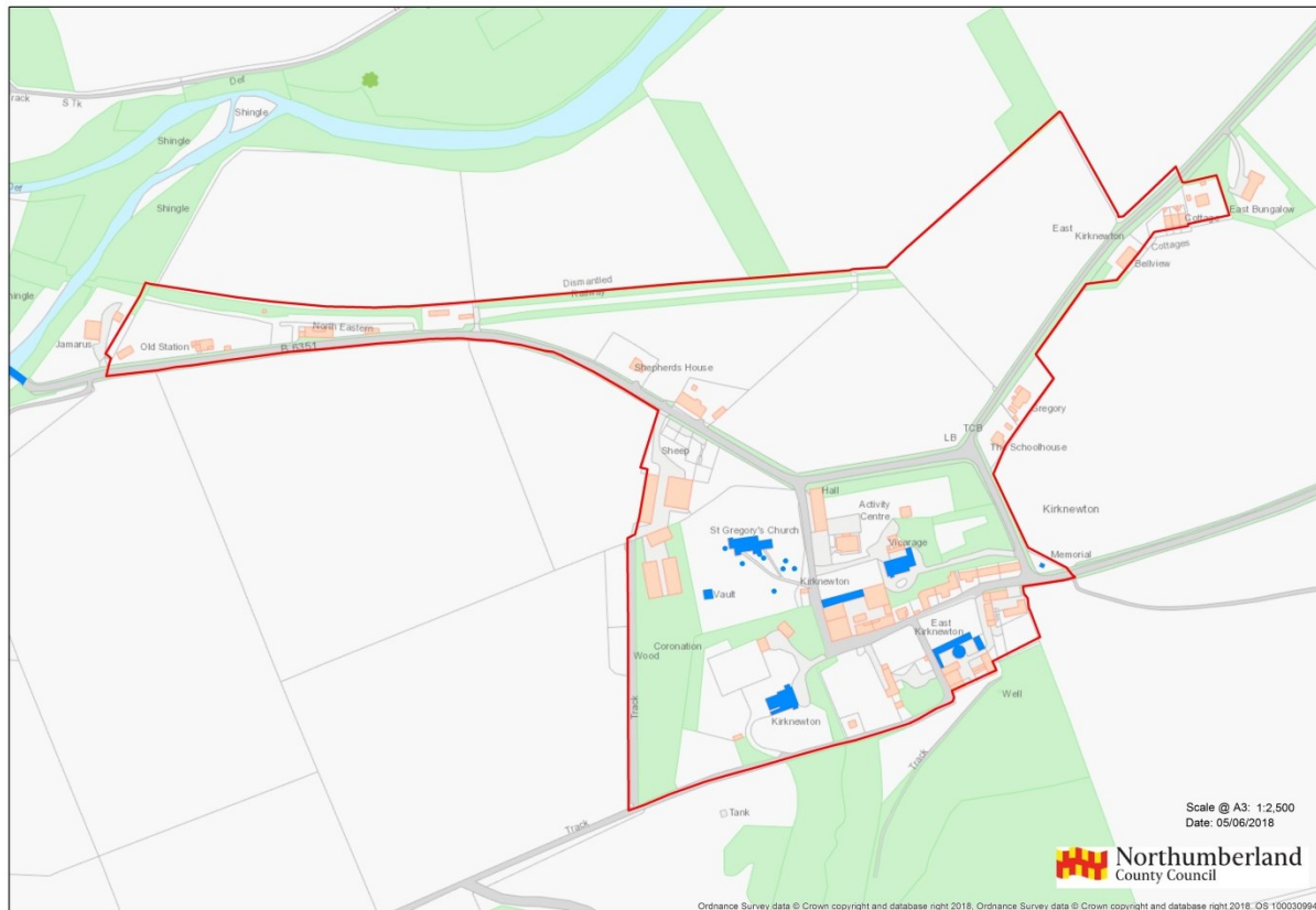
Figure 1: Conservation Area boundary and Listed Buildings