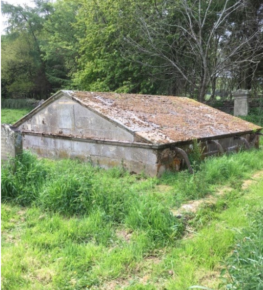
Figure 3: Davison mausoleum

II listed Davison Mausoleum is considered to be at risk and the grade II listed Davison grave is considered to be vulnerable. Some of the older listed gravestones are severely weathered and the engraving indecipherable and hence could also be considered to be at risk. The remainder of the listed buildings are in generally good condition and not considered to be at risk.