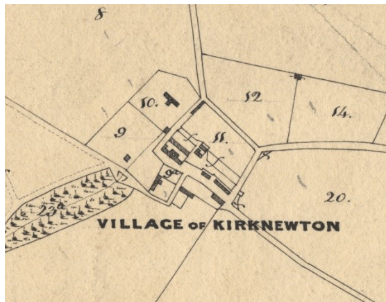
Figure 6: Tithe award enlarged plan 30 December 1843 (NRO DT279M)

The later history of Kirknewton village covers the transformation from a regular two-row village of the late medieval/early modern era into its present form, traceable on maps, trade directories and photographs.