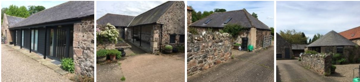
Figure 12: East Kirknewton Farm

and the closure of the school have led to a reduction in the size of the village population and profound changes in its demographic profile. The village is predominantly inhabited by commuters and retired people. Living standards have increased immeasurably in Glendale, in common with the rest of British society, whilst the social and economic opportunities available today are far greater than those facing the inhabitants of Kirknewton at the beginning of the 20th century.